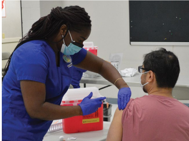
A Chamberlain College of Nursing student administers a COVID-19 vaccine at the Township's spring vaccine clinic.

already shown that the current vaccines are safe and effective for both children and adults. These trials are sufficiently ‘powered,’ meaning that they have enrolled enough people to be deemed statistically relevant.”