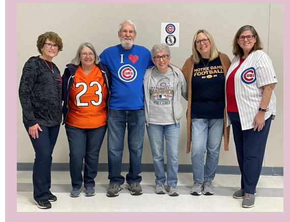
Thanks to these wonderful volunteers for all they did to make the sports event fun for everyone!

Deaf Social/Support Group in May : The theme was "Sports Day". The attendees had a great time with many fun activities related to Sports.