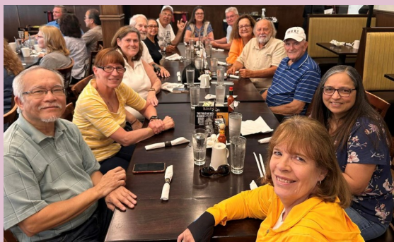
What a great way to spend a beautiful day with this fun group! So peaceful and beautiful scenery! Fun to explore St. Charles and Fox River and their rich history.