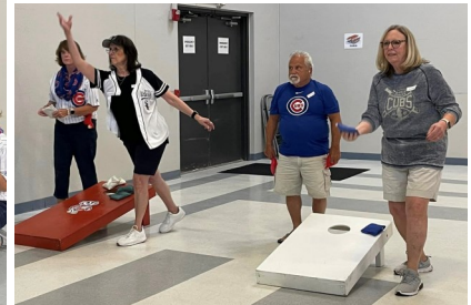
The indoor picnic (Sports Day theme) was a fun-filled day with games, trivia, chat, laughter, light exercises, and a great lunch!