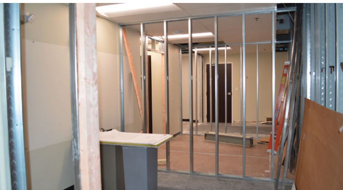
New office space is constructed at the Township.

From improving the accessibility of our building to kicking off the Mental Health Board's first fiscal year, progress has been abundant at Schaumburg Township. Through all the change, our Board's vision to improve the lives of all those we serve has held constant. We take great pride in acting on this goal, and we hope all residents share in that sense of pride for our township.