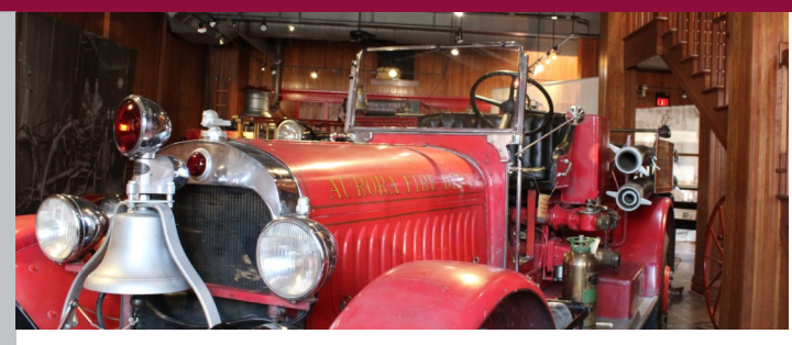
AURORA FIRE MUSEUM